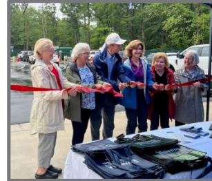
Grand Opening & Ribbon Cutting Ceremony

“Tag-A-Bag” household trash is also accepted