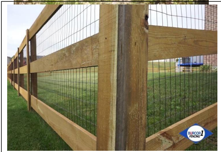
FLAT BOARD FENCE _ THESE ARE NOT APPROVED IN FOREST LAKES