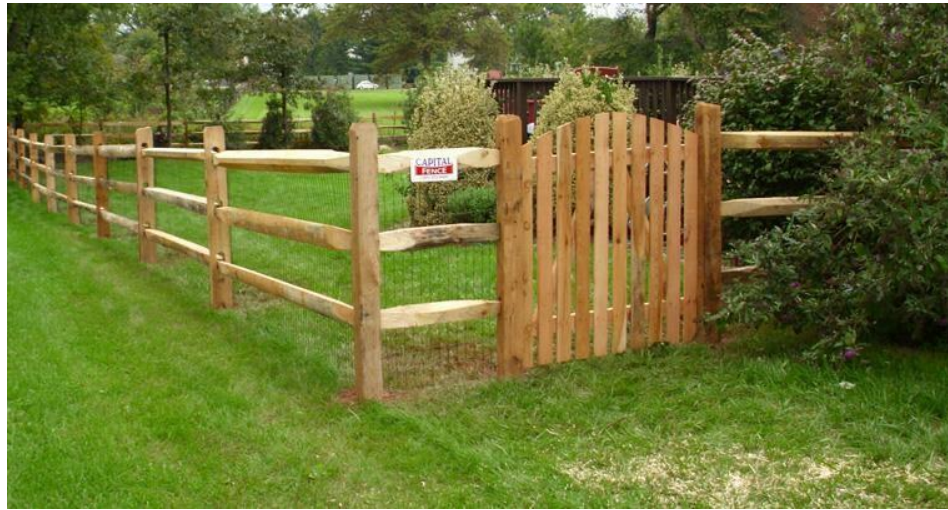
SAMPLE PICTURE OF SPLIT RAIL FENCE AND GATE