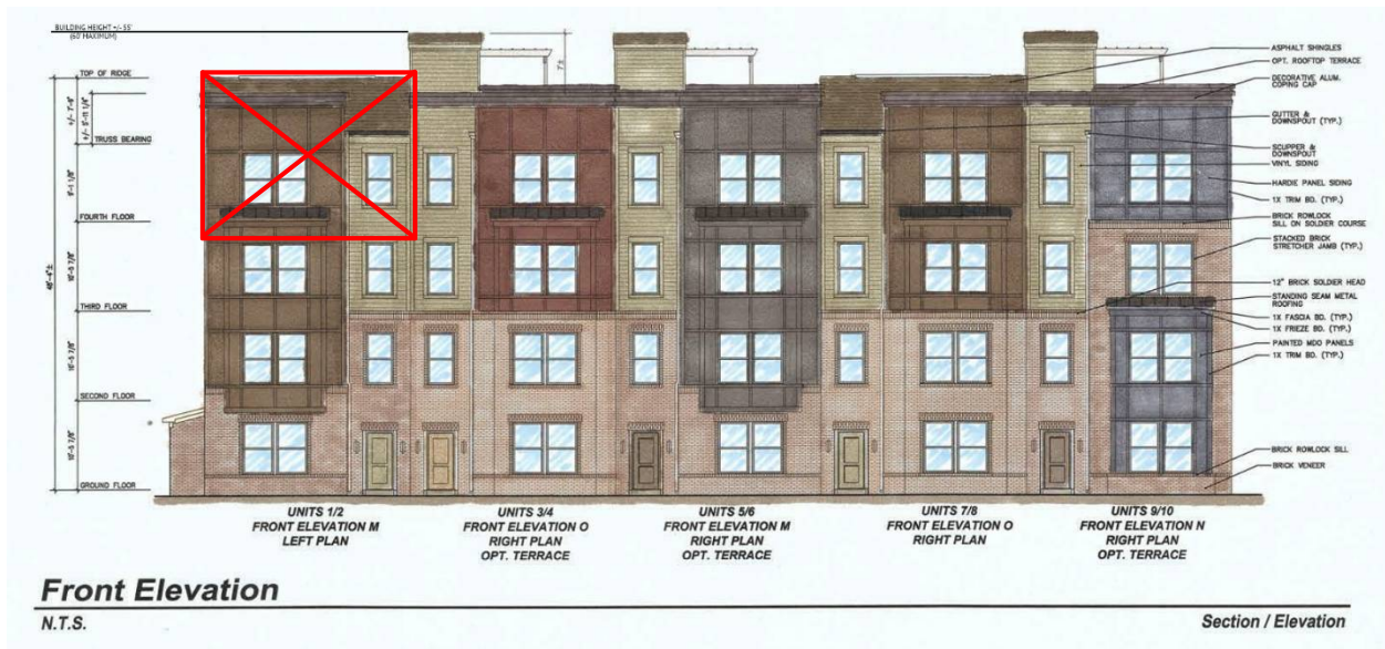
Figure 4. Illustrative Example showing the front elevation of a row of the Townhomes. The red box indicates the portion of the fourth floor to be removed, creating a single 3-story unit on the end of each row of the Townhomes.