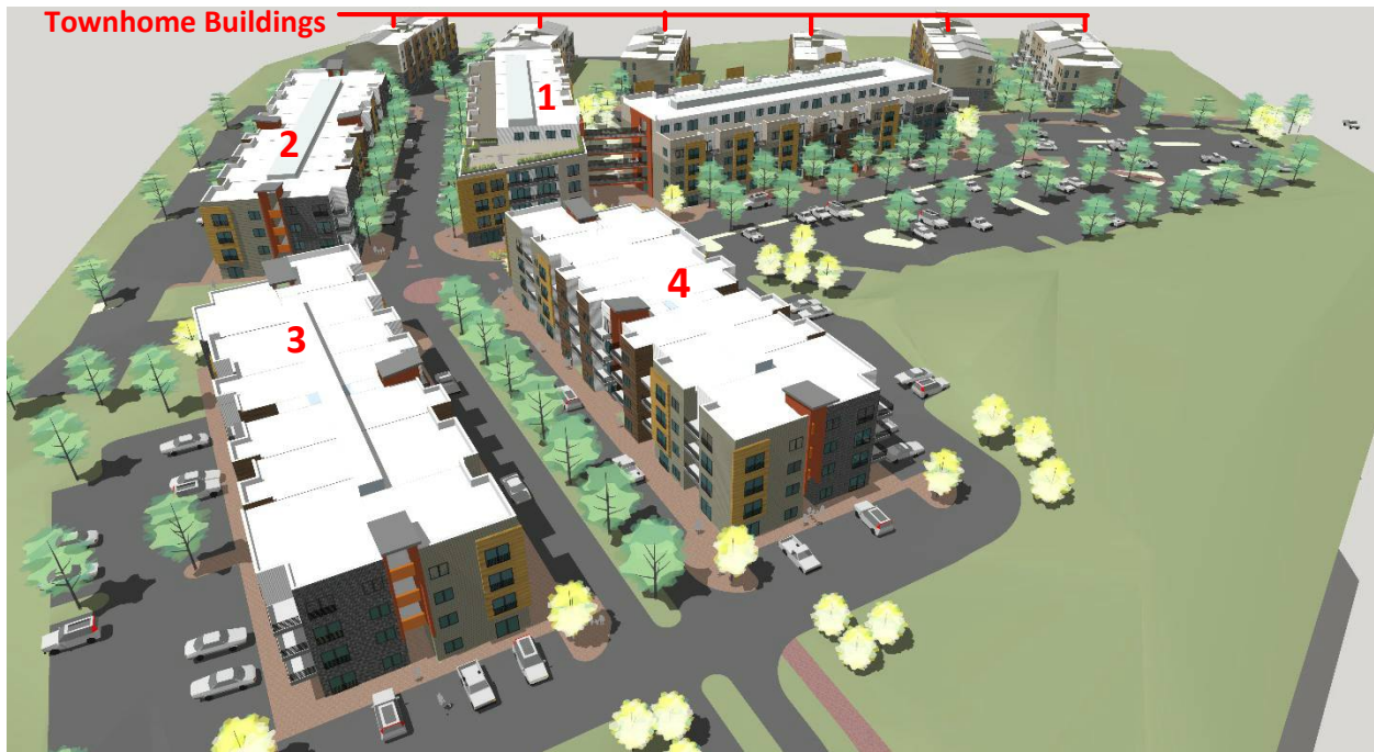
Figure 1. View of the Project, including Building 1 at center (the South Wing is at right).