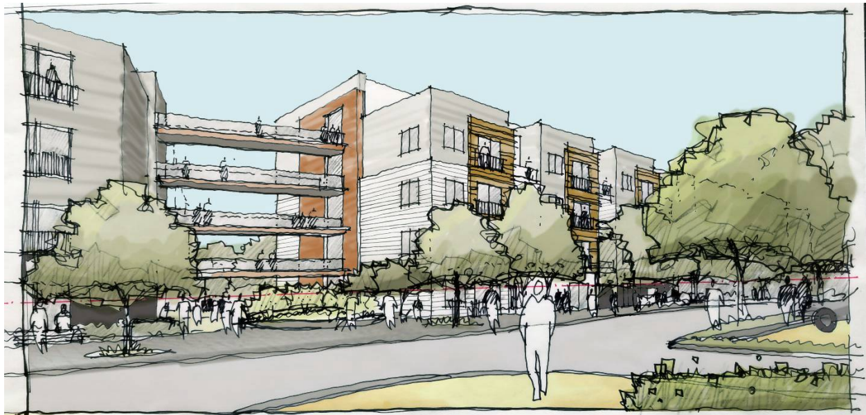
Figure 3. View of the front side of the South Wing.