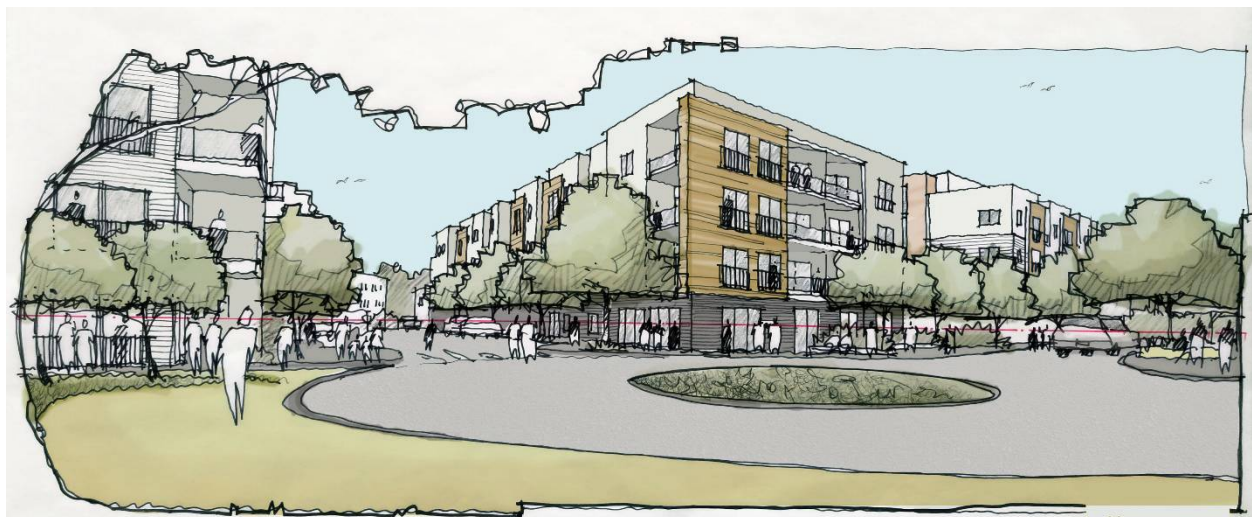
Figure 2. View of the North Wing (center) and South Wing (at right), separated from Building 2 (at left) by a shaded, pedestrian-friendly vehicular travelway. Note that the 5 th floor of the North Wing is not visible from this vantage point due to the proposed stepback on the 5 th floor.