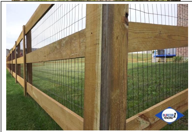
FLAT BOARD FENCE – THESE ARE NOT APPROVED IN FOREST LAKES