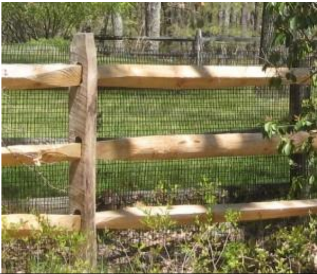
SPLIT RAIL FENCE