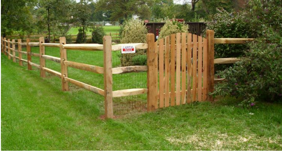
SAMPLE PICTURE OF SPLIT RAIL FENCE AND GATE

Split Rail fences are the only approved fences in Forest Lakes. Flatboard fences are not approved.